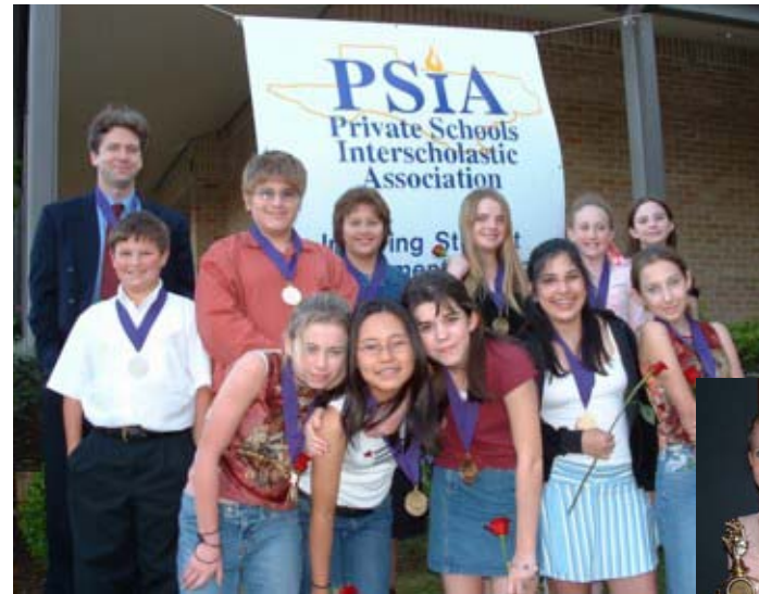
Left: 2004 State One-Act Play champion cast, Saint Mary's Hall, San Antonio, poses following the announcement of their first place ranking.

Look for the announcement of PSIA 8th Grade Honorarium Scholars in your June email and in the July Torch Newsletter .