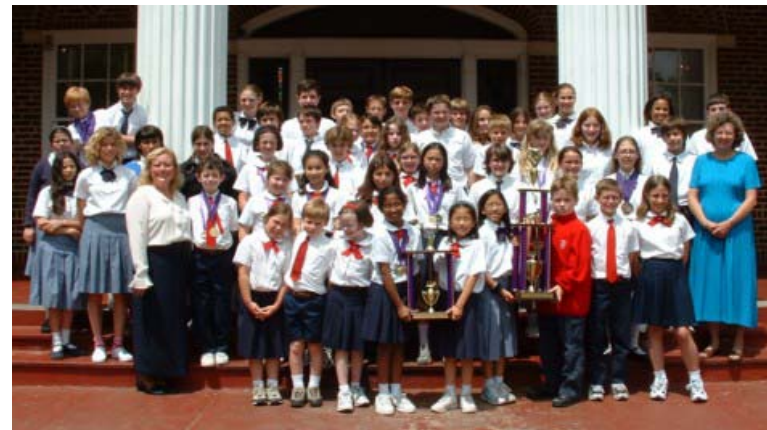
Kirby Hall, Austin - Repeat State "A" Elementary Division Champions

Kirby Hall, Austin, took first place in the 2004 State A Elementary Division ranking and second place in the Middle School Division.