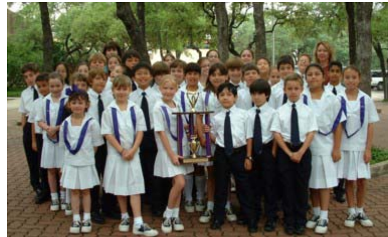
(Above) Saint Mary’s Hall, San Antonio, won second place overall in the 2004 “AA” Elementary Division.