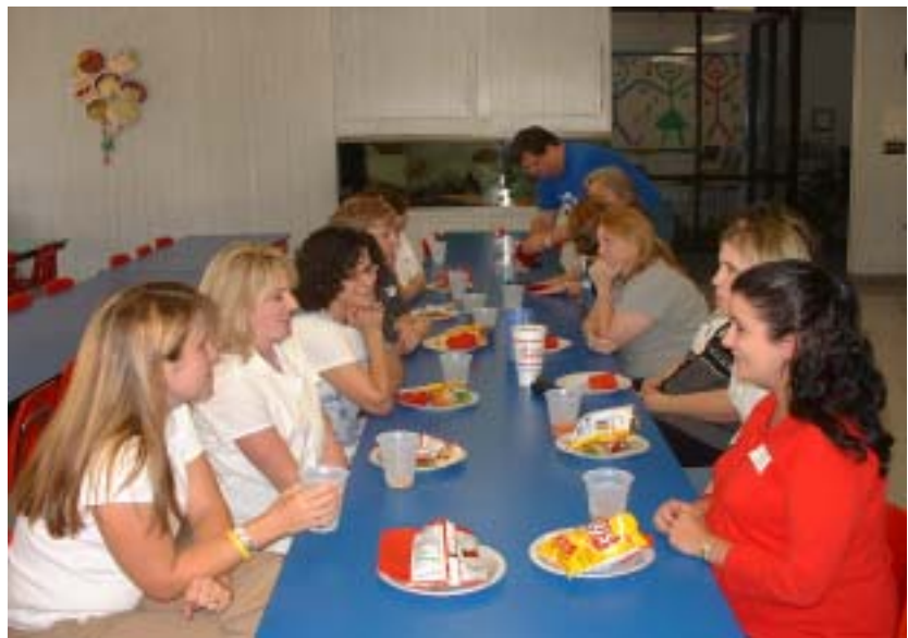
A few of the educators that met at Stepping Stone School in Tyler to find out more about rules interpretation and preparation for fun competition in the spring.