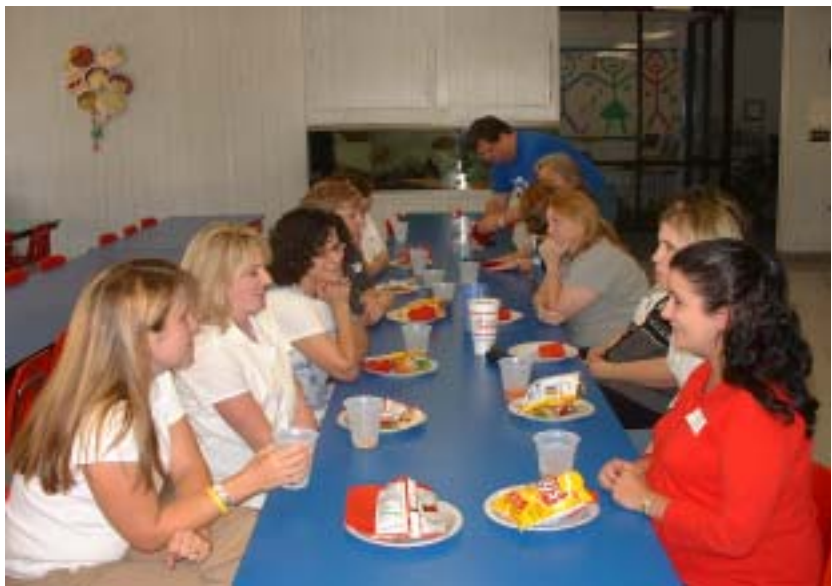
A few of the educators that met at Stepping Stone School in Tyler to find out more about rules interpretation and preparation for fun competition in the spring.