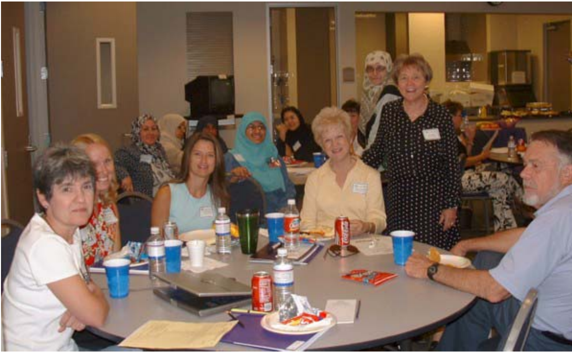
Participants at the Houston area workshop held at District 11AA host site, Trinity Lutheran School in Spring, share ideas about organizing their PSIA program during a working lunch break.