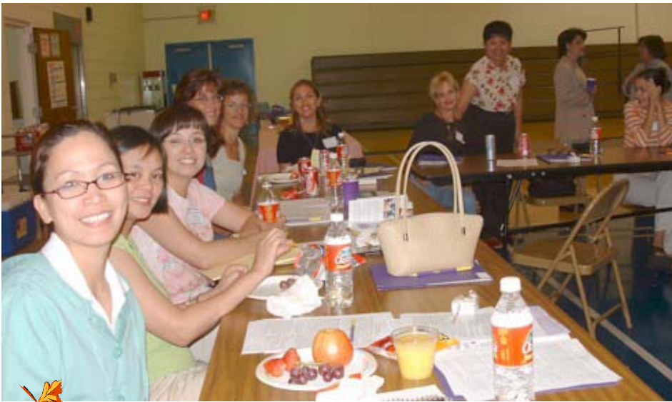
Teachers in South Texas meet at Incarnate Word Academy in Brownsville to learn about inspiring students through PSIA academic competition.

Inspiring Student Achievement Through Academic Competition