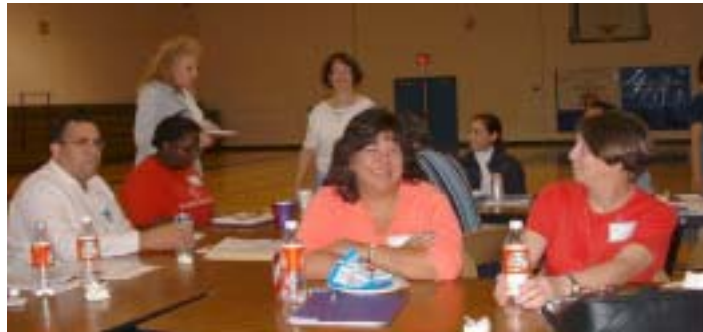
Break at the South Texas workshop