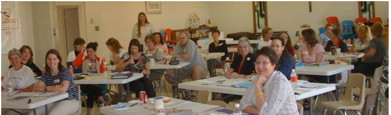
A scene during lunch at Christ the King Cathedral School - preparing for an exciting academic year.